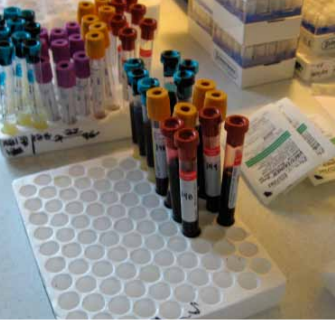
Ten to twenty vials of blood for research assessments were taken, at each measurement period: at the start, halfway and at the end of the three month

more in silence, without guided meditation. In addition, each of us had a weekly fifteen-minute interview with Wallace. tions between neurons, is astounding. Training in any field, Most of us meditated in our rooms, though some shared such as music or sports, can significantly alter connections a few sessions a day in the meditation hall. We took care of among neurons and modify the brain systems devoted to parall the washing up and cleaning of the building in rotating ticular tasks. Recent studies are adding meditation to the list